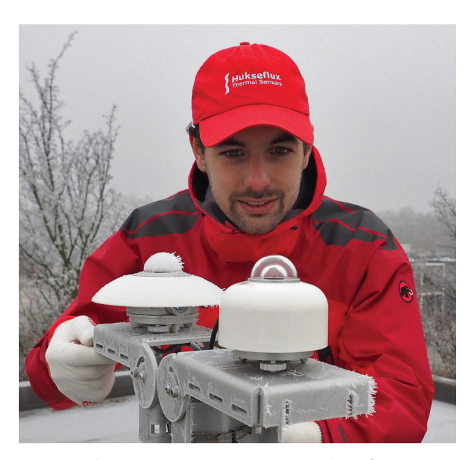
SR30 digital pyranometer with RVH™ technology (foreground), extreme winter weather conditions