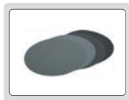
silicon carbide paper