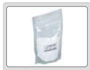
aluminum oxide powder