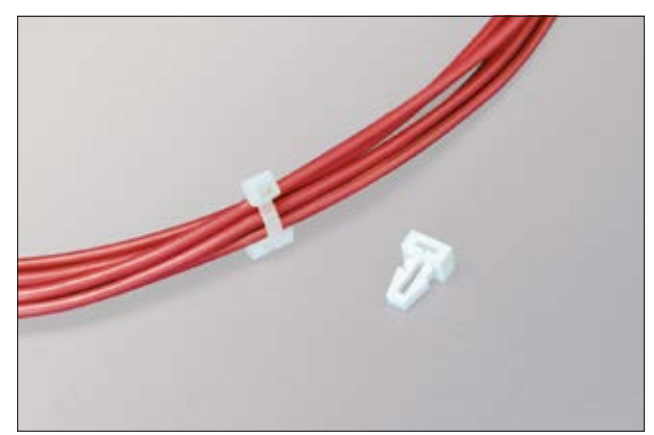
TM1SF Fixing Base for pre-drilled or pre-punched holes.