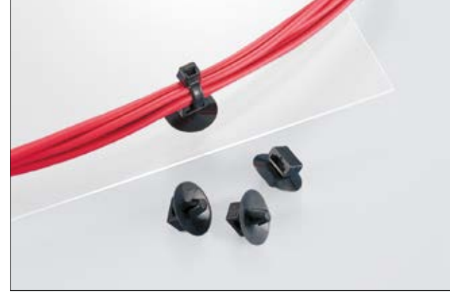
Securely fix and route cables and pipes with SFC3.