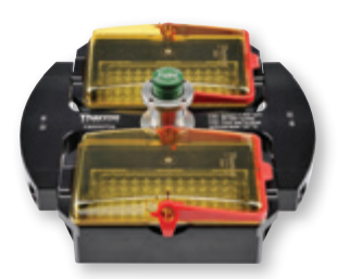
M10 Swinging Bucket Rotor