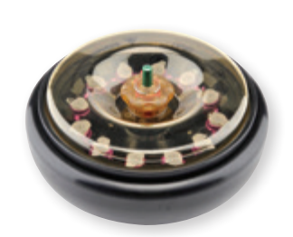
MT-12 Swinging Bucket Rotor